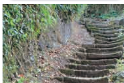
Worn stone steps curved towards the center.