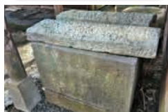
Digged wells in every house, can be seen everywhere in Shukunegi.