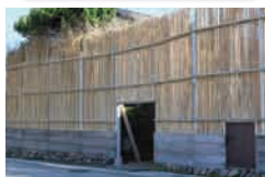
Fence of bamboos to protect the building from the sea breeze.