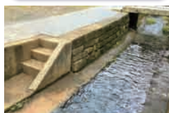
Formerly there were about 18 places.