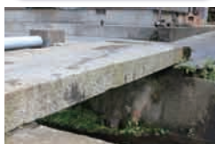
A stone bridge as a donation from Onomichi in 1776.