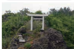
Deity of the Sea Benzaiten is enshrined. Also believed as a deity of Child.