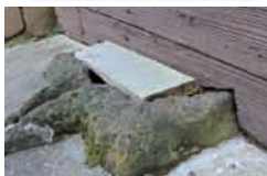
Stone-built settling tank.