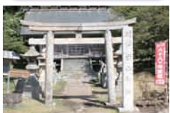
Stone Shrine Gate built in 1773.