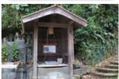
The residents of uplands were the main users of this well.