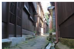
Stone pavement passage.