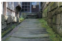
Flagstone that was carried by Sengokubune freight ship.